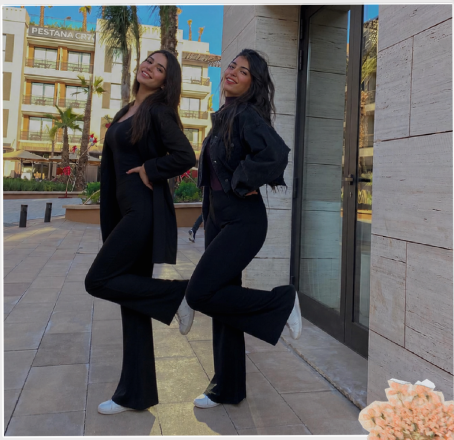
Life feels brighter with you in it.