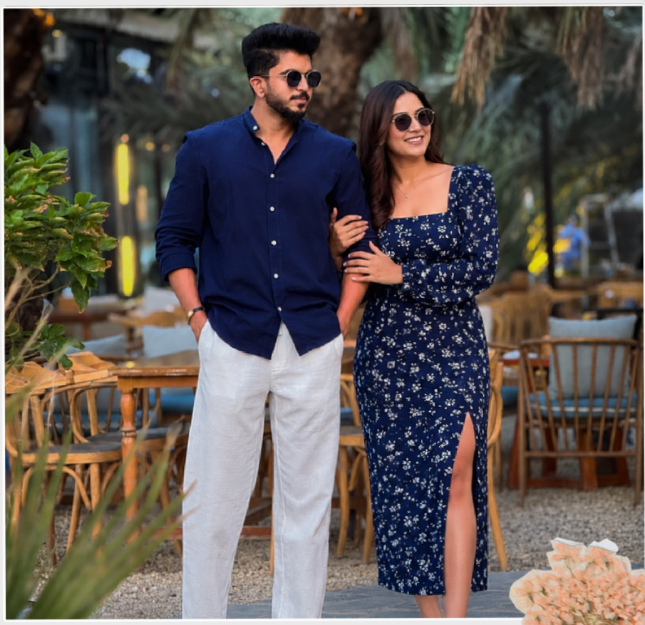
Life feels brighter with you in it.